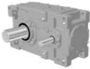
,Reducer: Parallel Shaft Horizontal Mounting>