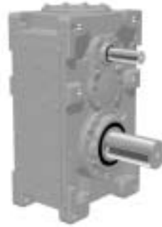
<Reducer: Parallel Shaft Upright Mounting>